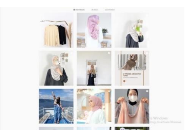
Figure 9. Feed on @mydailyhijab Instagram account

The @mydailyhijab Instagram account takes advantage of several Instagram features, including posts that permanently contain photos and videos in the account's feeds unless they are deleted, and then stories, which also contain photos and videos but are not permanent unless they are highlighted. In line with what is done by Papa Ganteng Coffee, which uses all Instagram features such as stories, highlights, post photo/video captions and hastags optimally to utilize Instagram as a marketing communication medium [25].