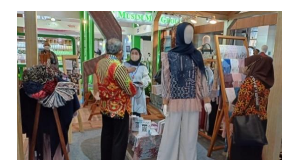
Figure 8. TEI 2022 event

Call Paper: Strategic Management & Entrepreneurship Towards the New Normal Era, Volume 1, March 2023 My Daily Hijab to attract potential customers and consumers and raise awareness regarding product brands.