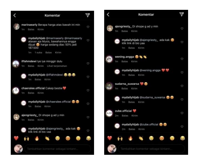
Figure 10. Evidence of interaction between @mydilyhijab followers and admin