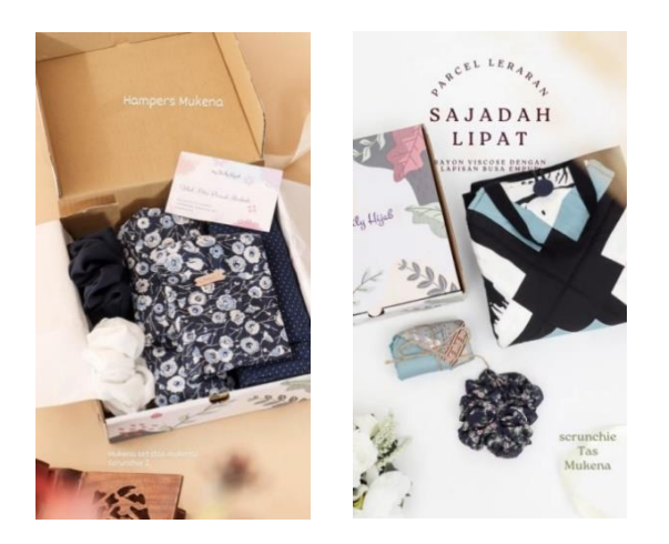
Figure 4. Gifts & Parcels from My Daily Hijab

My Daily Hijab conducts sales promotions to attract potential customers and consumers by providing the best offers. This is done to show our appreciation for their shopping. The sales team coordinates daily with each account manager in each market place, especially in relation to the exposure provided by the market place. In addition, offline marketing is also carried out by My Daily Hijab, such as exhibition events and fashion shows, as a media to promote their work to the wider community. My Daily Hijab also provides various bundling packages for gifts and hampers, for example, in the form of prayer mats, mukenas, etc.