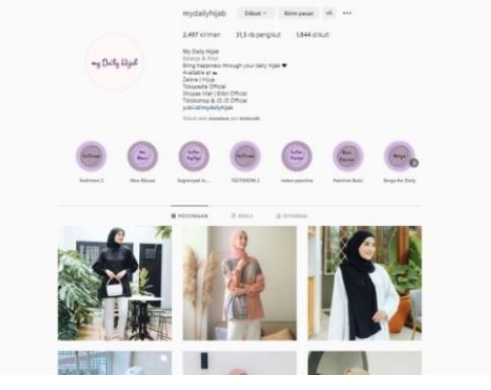
Figure 2. Instagram Page Account @mydailyhijab

Call Paper: Strategic Management & Entrepreneurship Towards the New Normal Era, Volume 1, March 2023